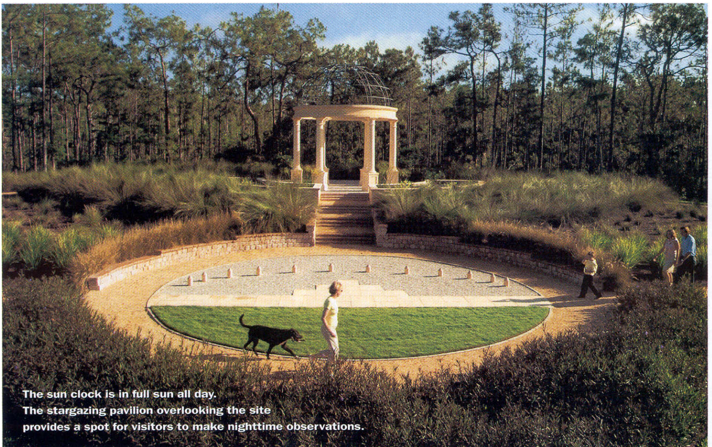
The sun clock is in full sun all day. The stargazing pavilion overlooking the site provides a spot for visitors to make nighttime observations.

DRAWING BY J. ROLAND LIEBER, PA LANDSCAPE ARCHITECTS.