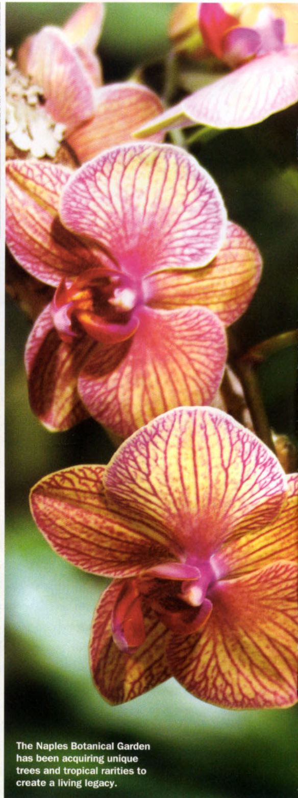
The Naples Botanical Garden has been acquiring unique trees and tropical rarities to create a living legacy.