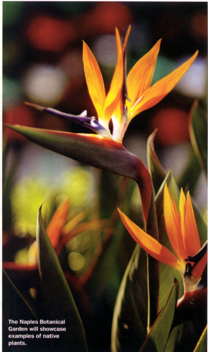
The Naples Botanical Garden will showcase examples of native plants.

Although the Naples Botanical Garden is closed during construction, members will be given opportunities to visit and tour parts of the garden as it grows. The James and Linda White Birding Tower will be one of the first projects to be completed, with birding tours to begin in the fall. The Discovery Center, a joint research and educational project with Florida Gulf Coast University, is already under construction and will open in fall 2009 with two laboratories, five classrooms and offices for about 10.