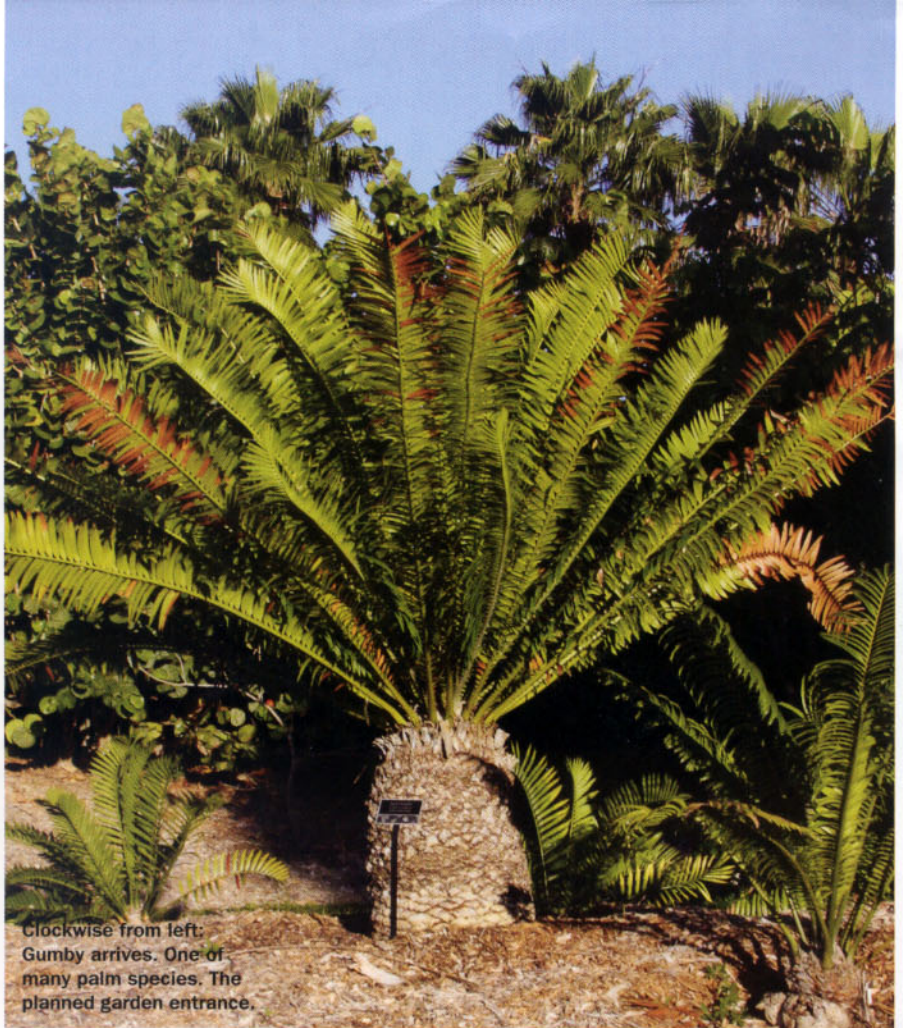
Clockwise from left: Gumbo arrives. One of many palm species. The planned garden entrance.

Keeping the dead tree is part of the plan to keep the garden natural. Dead plants provide shelter, nutrients and diversity to the evolving landscape, which already has more than 1,000 varieties of tropical plants and 90 acres of preserve with seven different ecosystems. Prior to removing exotic plants that had invaded the 70-acre site, planners saved trees, shrubs and small epiphytes (air plants), inviting the public to go on the search-and-save missions